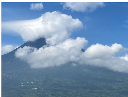
Above: Sightseeing in Guatemala

The class schedule set for me was: four hours of classroom group instruction, and then 2 hours of one-on-one training. In each class, the complete lectures, discussions, and instructions were fully communicated in Spanish. Although I sometimes did not understand most of the lesson, I was able to catch up while doing homework, from extensive notetaking. In the school, there were students from all over United States as well as the world. In my classroom group, some were from Great Britain, New Zealand, and the Netherlands. One sixteen-year-old young man came from California with his mother and grandmother. This family were all studying and improving their Spanish, through the Máximo Nivel program. Although I was among the oldest participating in the Spanish immersion that week, the young people were kind and helpful when needed. On more than one occasion I was complimented for taking on this endeavor at my age. I took the comments as compliments. The teachers, all local and from the city of Antigua, were friendly but kept to the rule of Spanish 100% of the time while teaching.