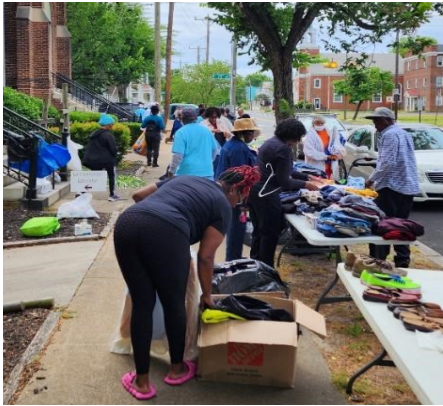
Above: Set up for the clothes giveaway

The Bethlehem Baptist Men’s Fellowship and the Jannie Jennings Church School Class were willing and ready to join in with The Well to have a Community Fun Day combined with a Clothes Give Away. The men passed out hundreds of flyers and people were in a ready-set-go position to start cleaning out their closets. The excitement was building as the day slowly approached. However, we all were concerned that the event would be rained out because the ten-day forecast predicted rain for that Saturday.