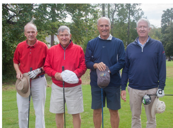
Pictured above: The first and second place teams of the first grouping/tier.