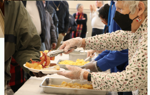
Pictured above: the Mobile Ministry van, top and bottom right: Compassion Ministry team of FBC and RRCB preparing and feeding the Homeless.