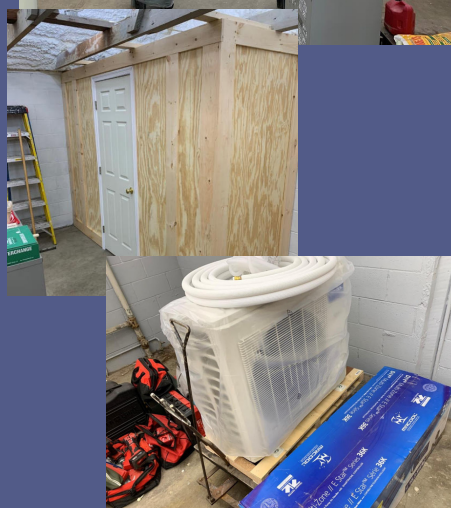
Pictured from the top: work in progress, middle: new secure space and storage, bottom: installed mini split unit for temperature control