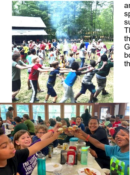
Above: enjoying campfires and cupcakes

But we don't just live out God's love at camp, we talk about it, too. Each day, after eating breakfast in the dining hall and doing our camp chores to keep things tidy, our campers gather in their cabin groups for Bible Study. Our goal during Bible Study—like all of our camp activities—is to meet our campers where they are. We do this by asking open ended questions and gently challenging them to wonder about world around them and to claim the spiritual depths inside of them.