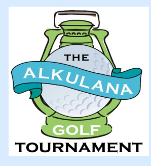
CAMP ALKULANA GOLF TOURNAMENT October 9, 2023 Richmond Country Club Sponsors and Teams can Register at www.alkulana.org