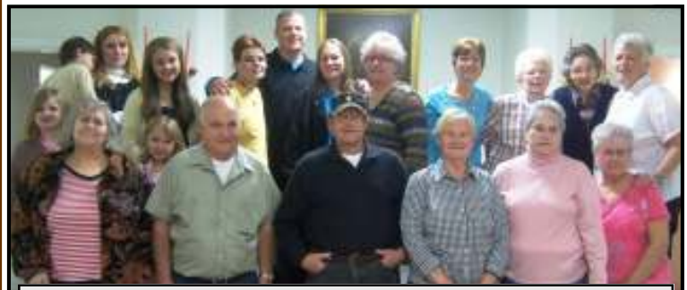
VOLUNTEERS FROM PINE STREET & OREGON HILL CENTER